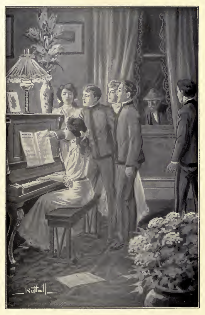
A MAN WAS OUTSIDE PEERING IN AT THE PARTY.—Page 151. The Rover Boys on the Farm.